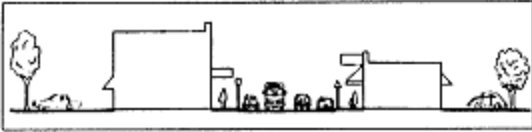
Transit oriented development